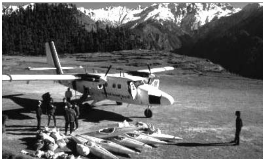
Figure 29.4 Rigid canoes and kayaks will fit inside many small planes and can be strapped to the struts of float planes such as Beavers, or suspended underneath a helicopter

most large airliners – if the airline carry surf boards and windsurfers, you should have no problems with kayaks. Baggage handlers actually prefer them to boards because they are much more robust.