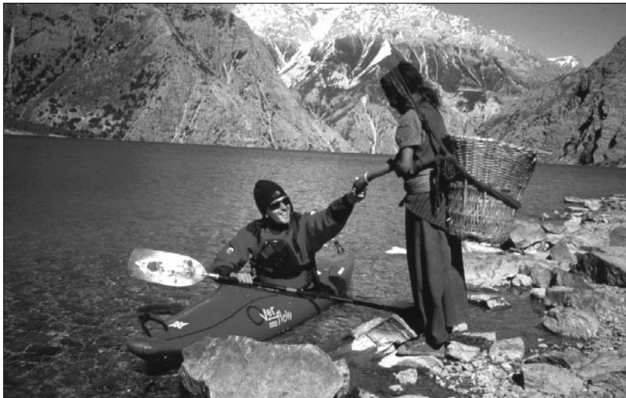
Figure 29.1 River travel gives opportunities to meet local people and should have minimal impact on the environment

We have all been brought up on tales of the fur traders and explorers in their Indian canoes, and Eskimo hunters in their kayaks. Less well publicised are the more modern journeys by kayaks and canoes across the Atlantic, a solo circumnavigation