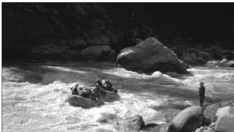
Figure 29.2 A grade IV rapid on the Tamur river, Nepal

equipment to the limits and beyond. Take good, strong, tough equipment. Expect and make allowances for breakage and loss, and don't forget a large repair kit. Take a visit to your nearest specialist retailer to get expert advice.