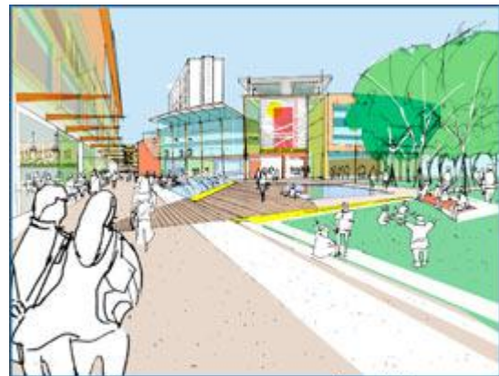
Bracknell's new town centre should be green and have state-of-the-art buildings