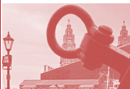
Pier head