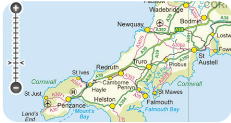
© Crown copyright and database rights 2011 Ordnance Survey