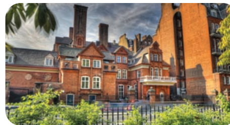
North Face