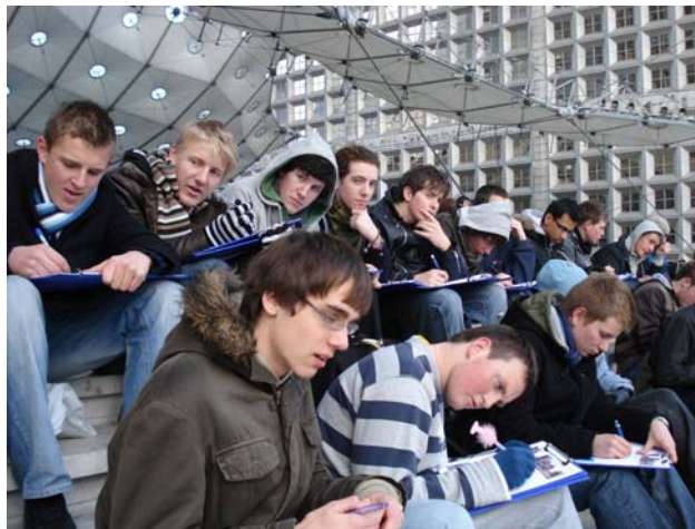
Students at work beneath the Grande Arche at la Defense