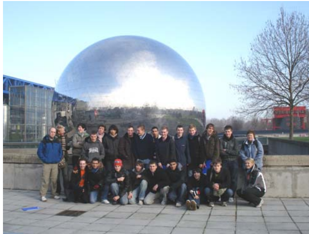
Students in the Parc de la Villette in front of the Geode The impressive entrance to the Cite de la Science