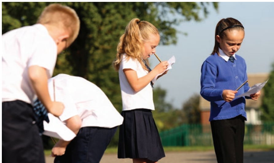
Collecting data in the school grounds.

The school grounds and local area are the best contexts for many fieldwork experiences throughout the primary age range (Tanner and Whittle, 2015). An audit of your school's local area will reveal the specific opportunities it offers. (A document to support your audit is available to download with the framework – see web panel.)