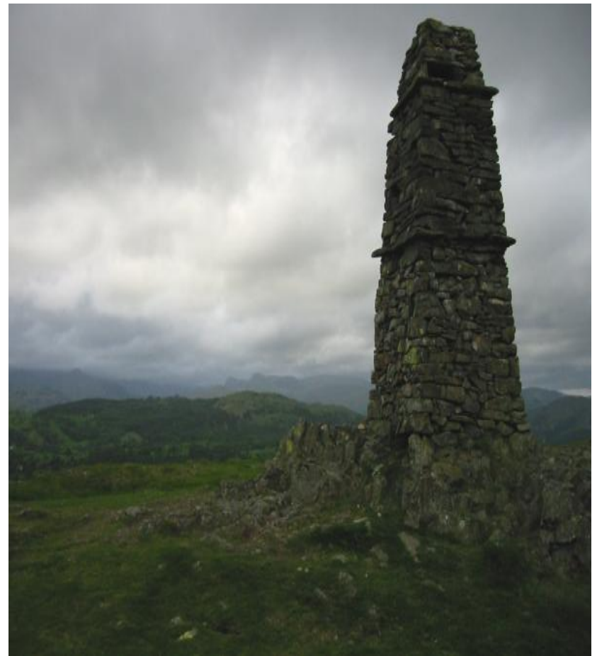
The Langdale Pikes, Latterbarrow