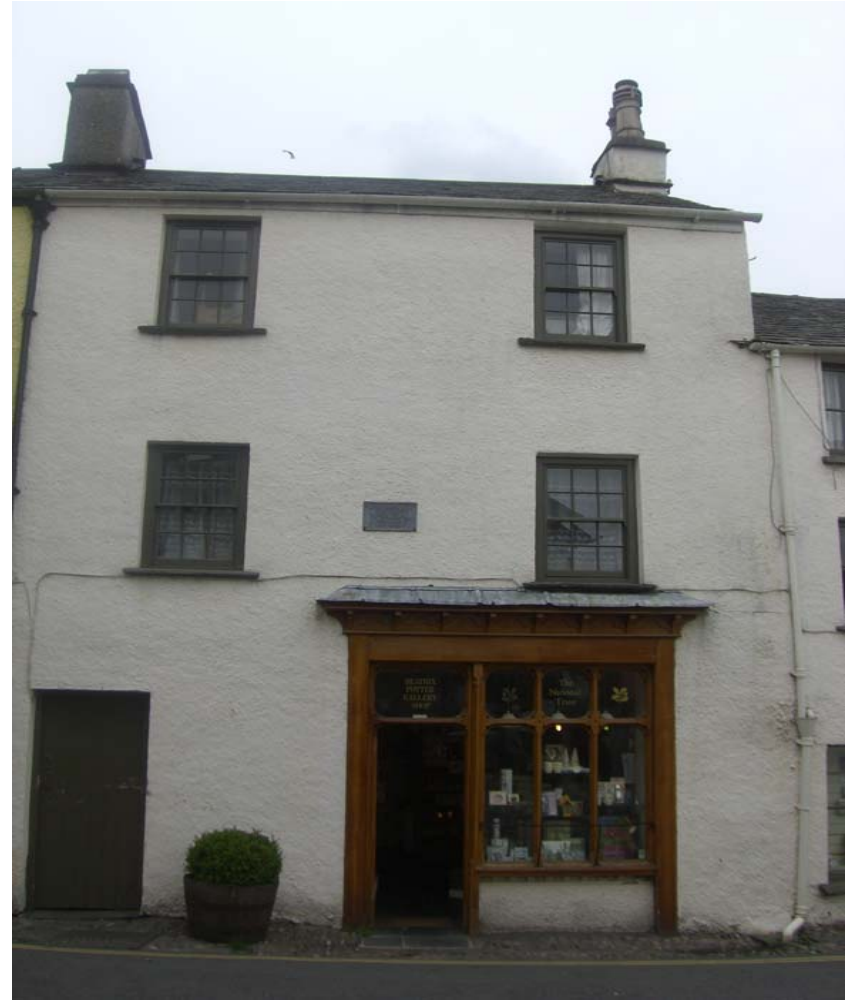
Beatrix Potter Gallery, National Trust