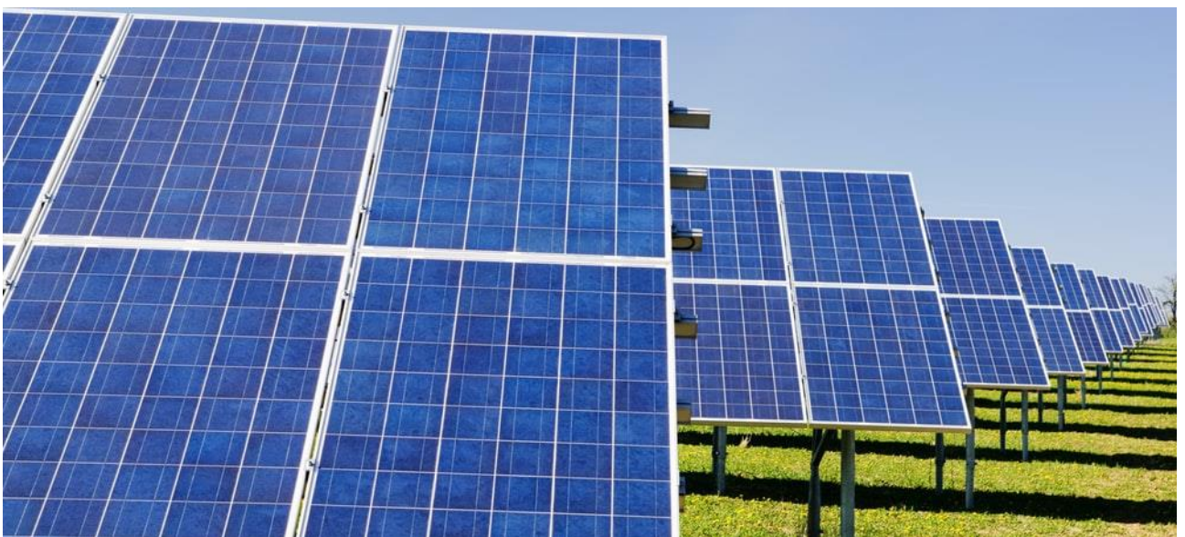
Figure 2 a solar power field

Figure 2 shows a traditional silicon crystal solar panel. A solar panel is made from a semi-conductor which absorbs sunlight i.e., photons. Photons are absorbed, hit into electrons, and produce kinetic energy. Electrons carry the current and move around the semi-conductor which is surrounded by electrodes — allowing the electrons to flow out of the panel, into an electric circuit and out into the National Grid. In the past most solar panels were constructed with silica, which only absorbs red light, and excess blue light is lost as heat. Go to the BBC Bitesize webpage to learn more about the basic definition.