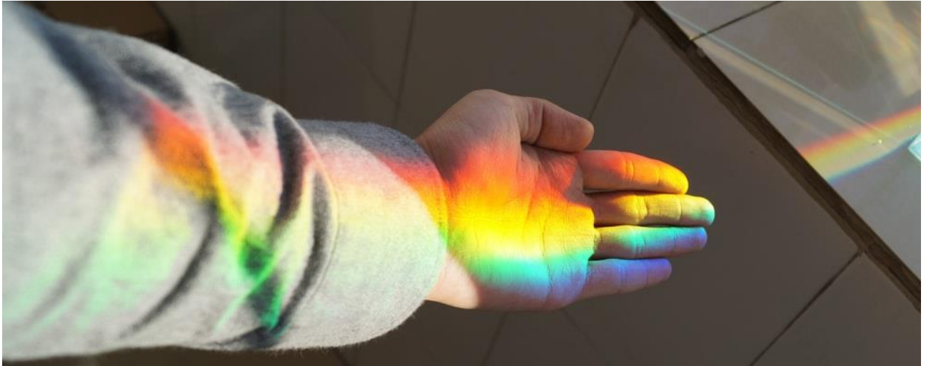
Figure 1 © Yingchih

Richard Of York Gave Battle In Vain. What does this lyric help you with?