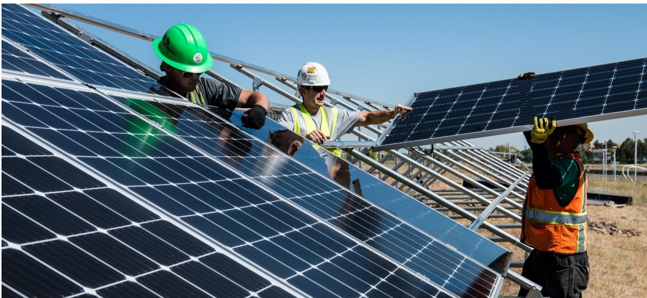
Figure 3 workers with solutions of all-inorganic perovskite quantum dots

Perovskite was discovered in the Ural Mountains in 1839 but it has only very recently been recognised as a valuable, viable mineral in solar power. It is now used in solar panels around the world. Figure 3 shows engineers installing all-organic, perovskite quantum dot solar panels.