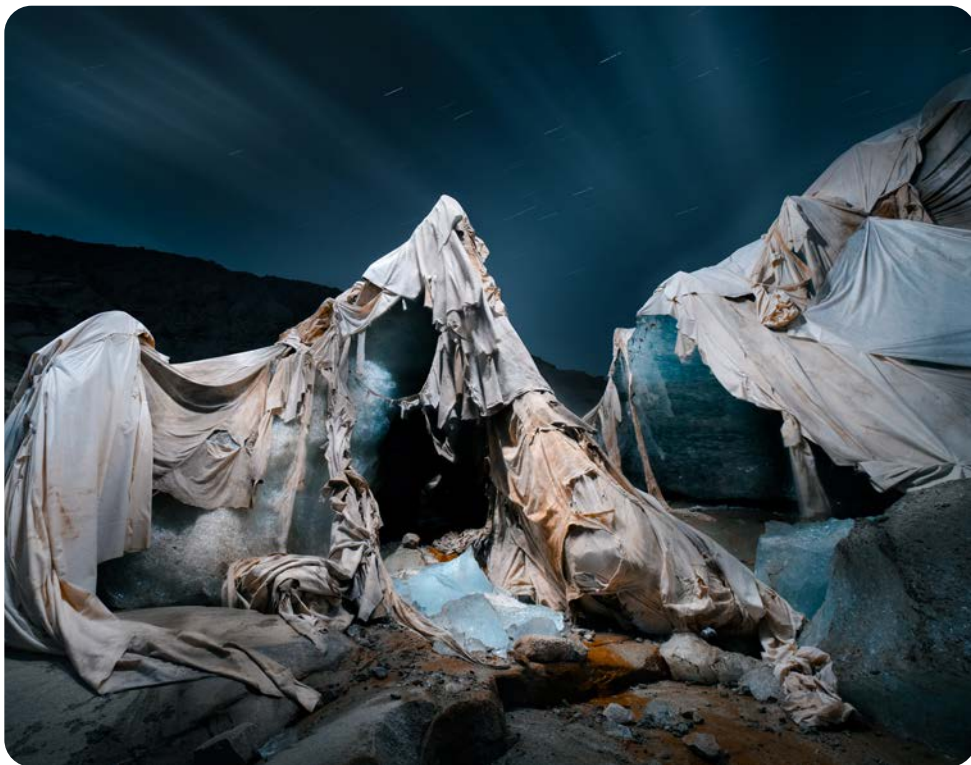
Calross of the Ice Bear © Liam Neill