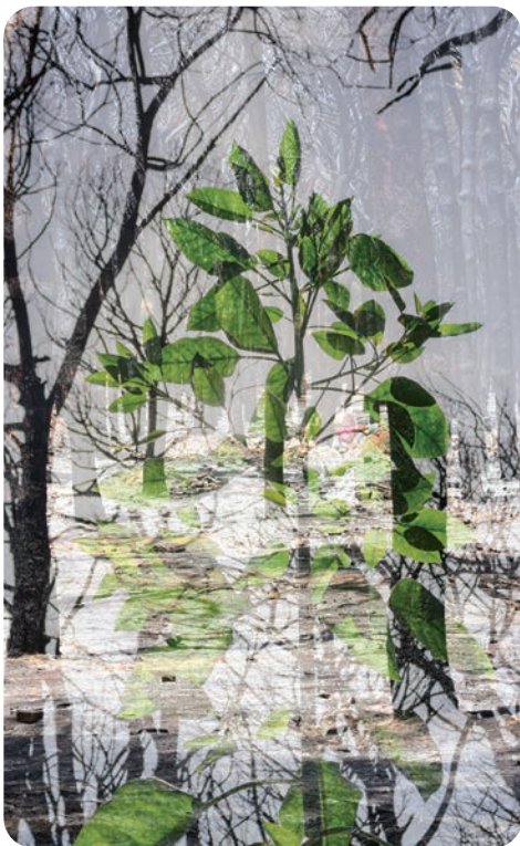
La Hepica – Consumed Living Spaces