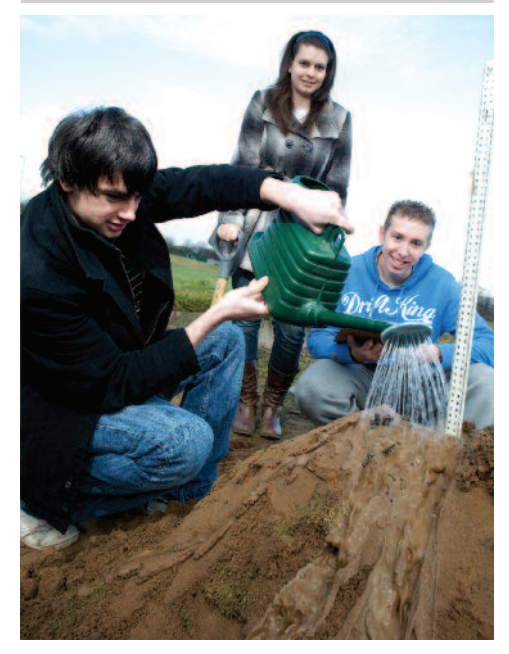
levels of pupils expressing an interest in choosing geography. For example, pupils at three Manchester schools were asked about their interest in choosing geography at GCSE prior to their attendance at a Going Places with Geography conference. 24 said they planned to, 19 said not and 25 were undecided. Following their attendance 45 planned to choose geography, 3 said not and 20 were undecided.

Legacy: The RGS-IBG is delighted that Esri UK<sup>2</sup> has agreed to become a corporate partner and will support will the running of the Geography Ambassador programme for three years from April 2011, as well as enhance it with a new group of ambassadors from the Geographical Information industry.