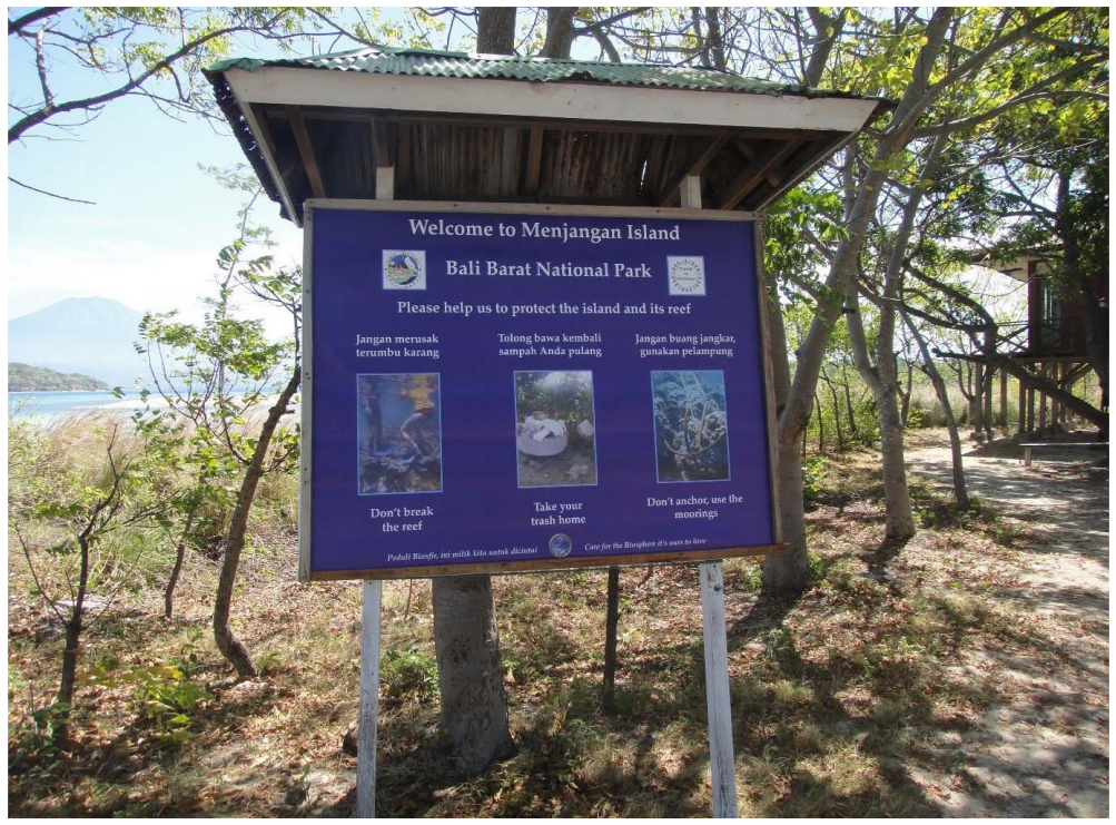
Work with the 'Friends of Menjangan' to protect the area.

Advancing geography and geographical learning