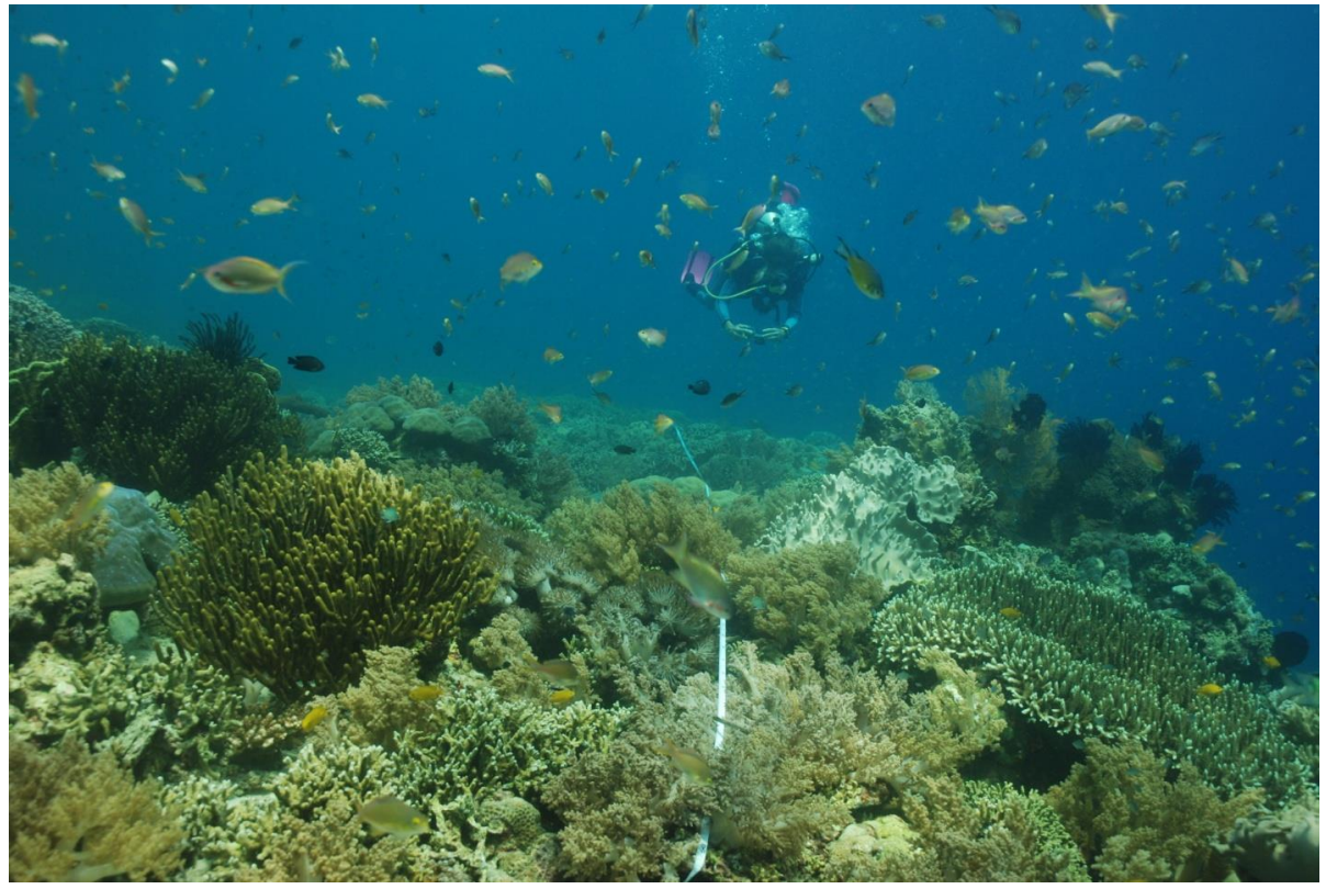
Species abundance observations being taken along one of the 50m long transects.

Advancing geography and geographical learning