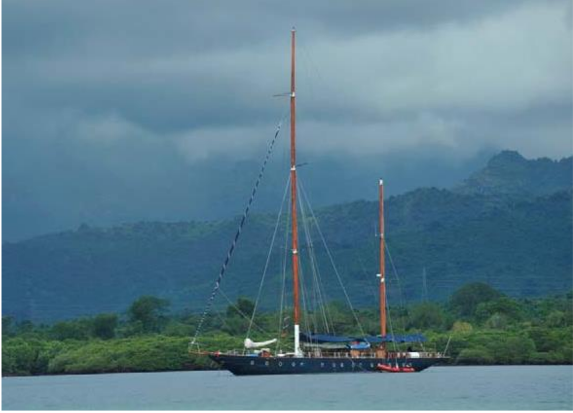
The Mir – the research base

Advancing geography and geographical learning