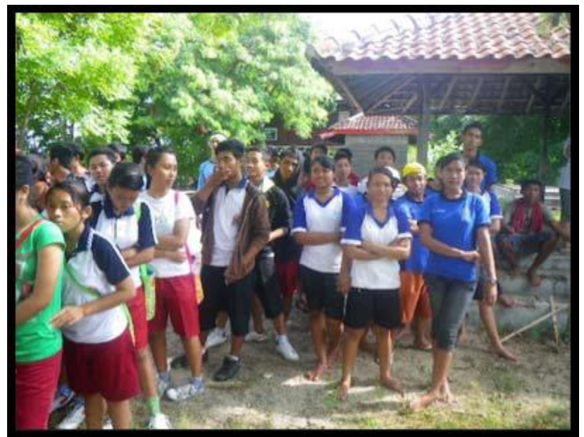
Work with the local community and school children through 'Friends of Menjangan' on an island litter pick.