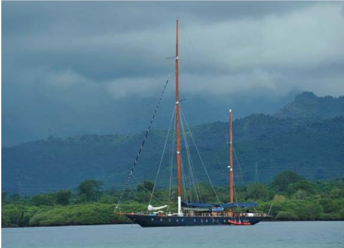
The Mir – the research base

'From the field' Awards - Inspiring fieldwork supported by the RGS-IBG. Delivered in collaboration with The Goldsmiths' Company