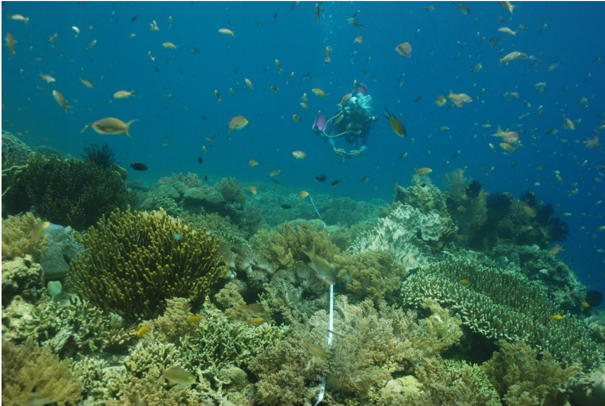
Species abundance observations being taken along one of the 50m long transects.