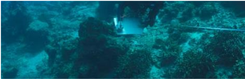
Orla Doherty recording reef damage.