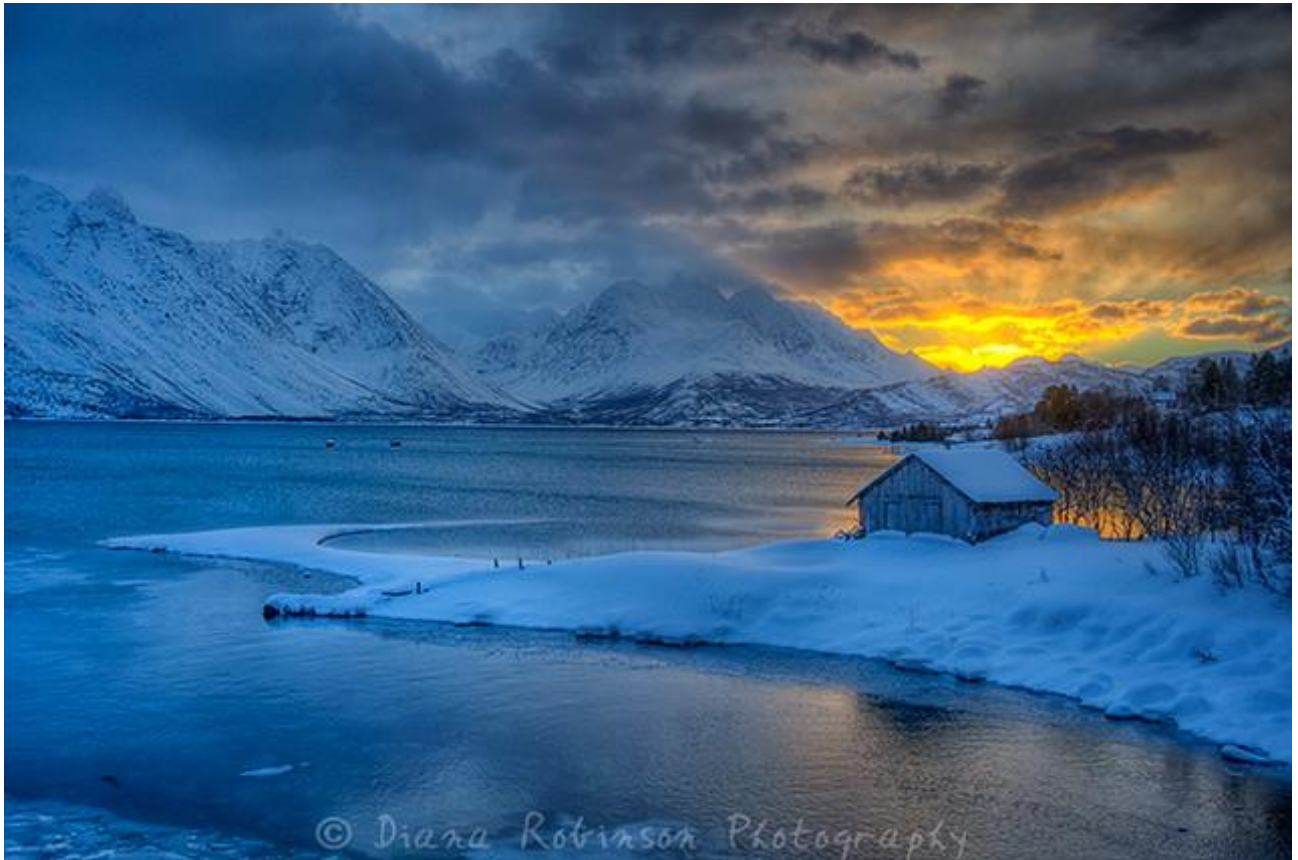
Figure 1. The Arctic sunrise near Ullsfjord in Norway

The Arctic is an area unlike any other in the world. Its natural beauty brings wonder to all who have the privilege to experience it. From steep mountain ridges, fjords, diverse wildlife to the extreme temperatures, midnight sun and unique vegetation the Arctic is truly a magical place.