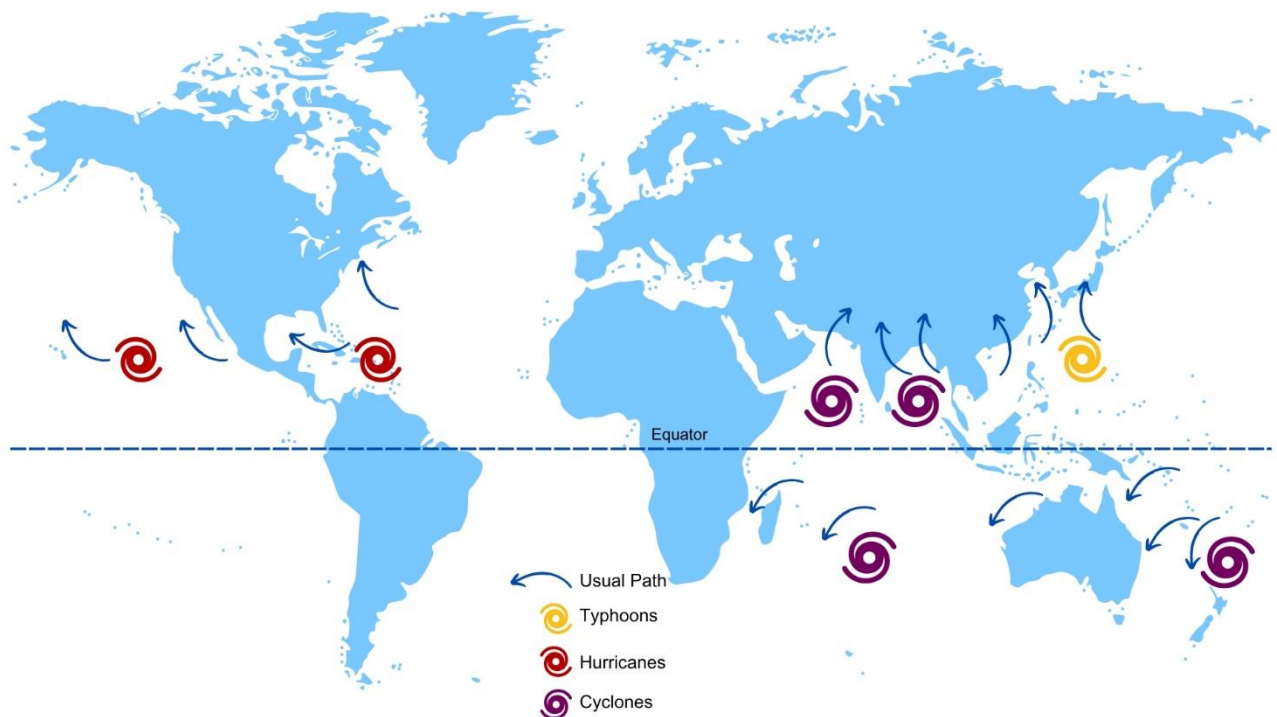
Figure 1: Tropical storm names according to their location

Hurricanes (North Atlantic and Northeast Pacific Oceans), like cyclones (South Pacific and Indian Oceans) and typhoons (Northwest Pacific) are large tropical storm systems characterised by high wind speeds (exceeding 119 km/h or 74 mph) and heavy rainfall. These storms are typically 806km (500 miles) wide and 16 km (10 miles) high.