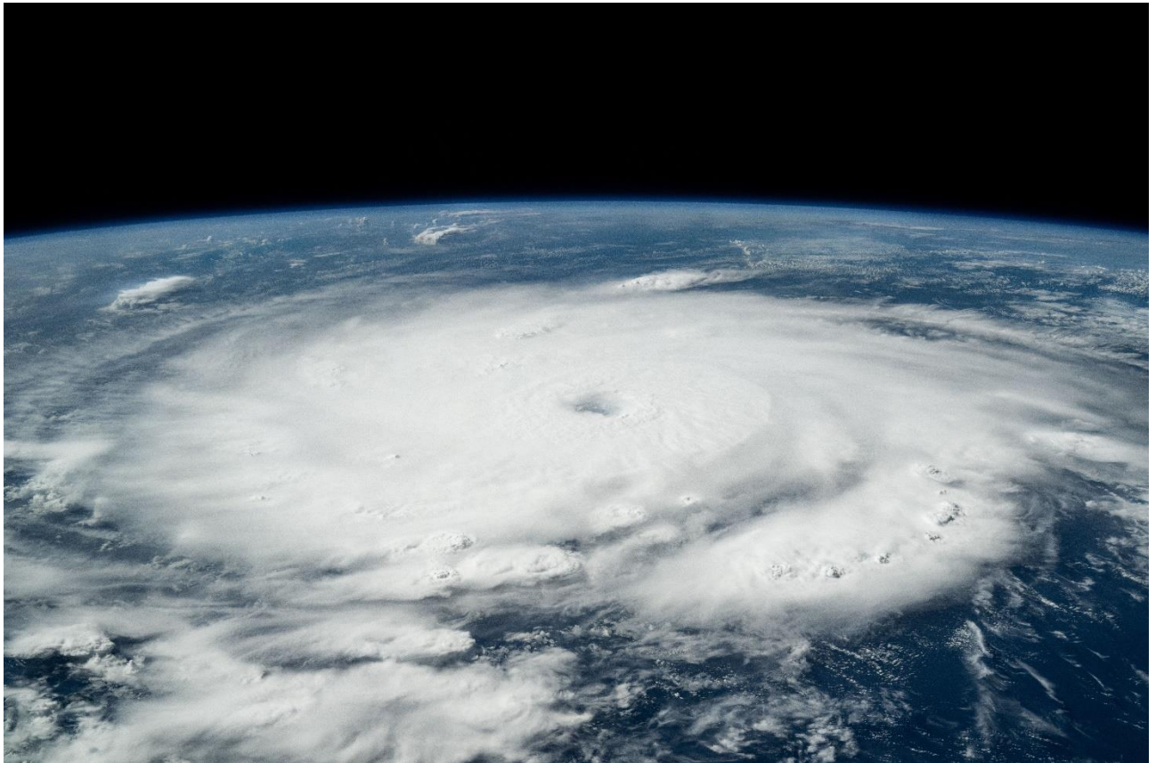
Figure 3: Satellite image of Hurricane Beryl as a category 4 storm off the coast of Grenada 1 st July 2024

Hurricane Beryl increased in strength after leaving St Vincent and the Grenadines, reaching wind speeds of 165 mph on 2 nd July and was classified as a Category 5 storm – the highest category in the Saffir-Simpson Scale.