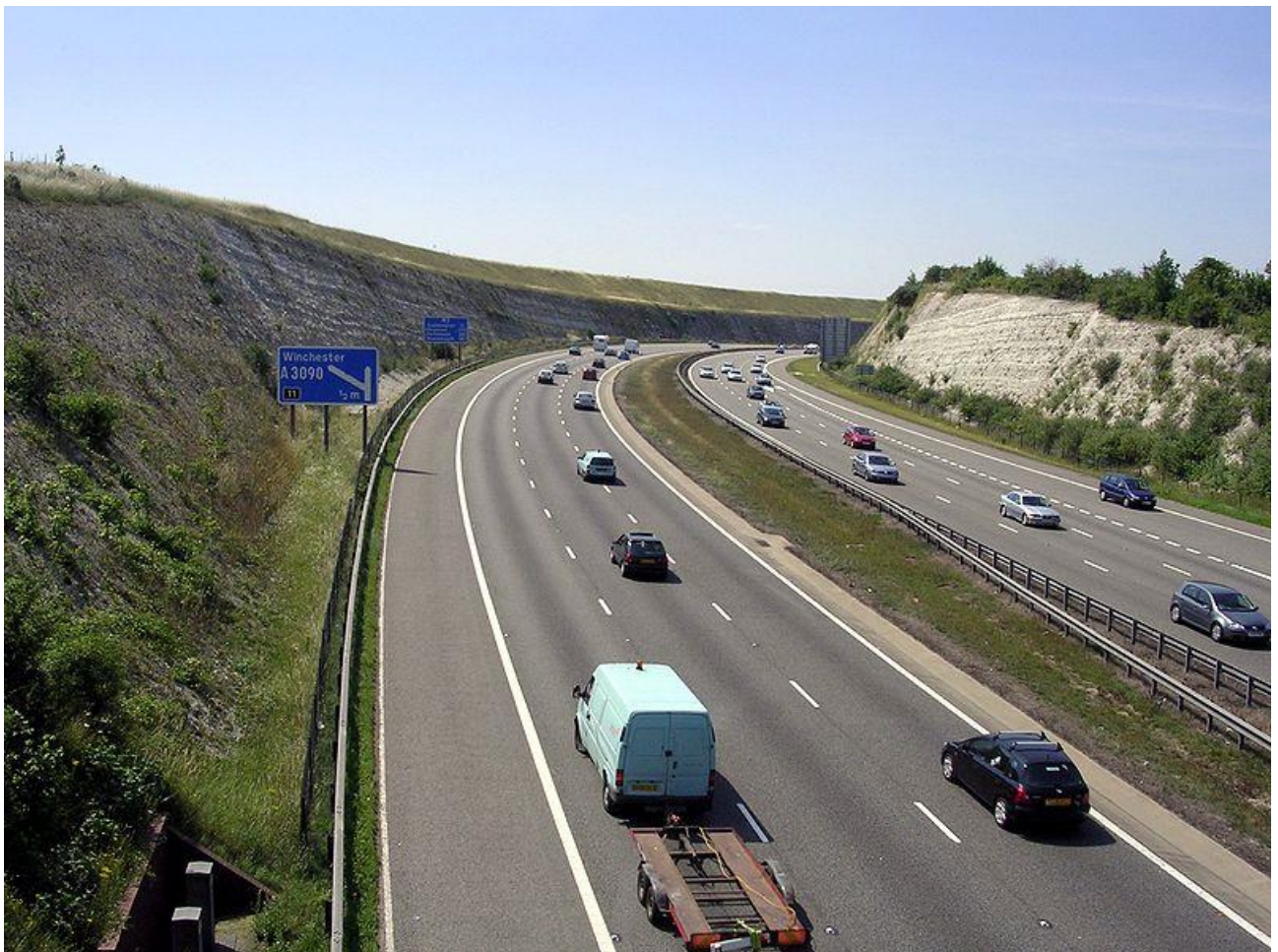
Figure 2: Road cutting at Twyford Down, Hampshire