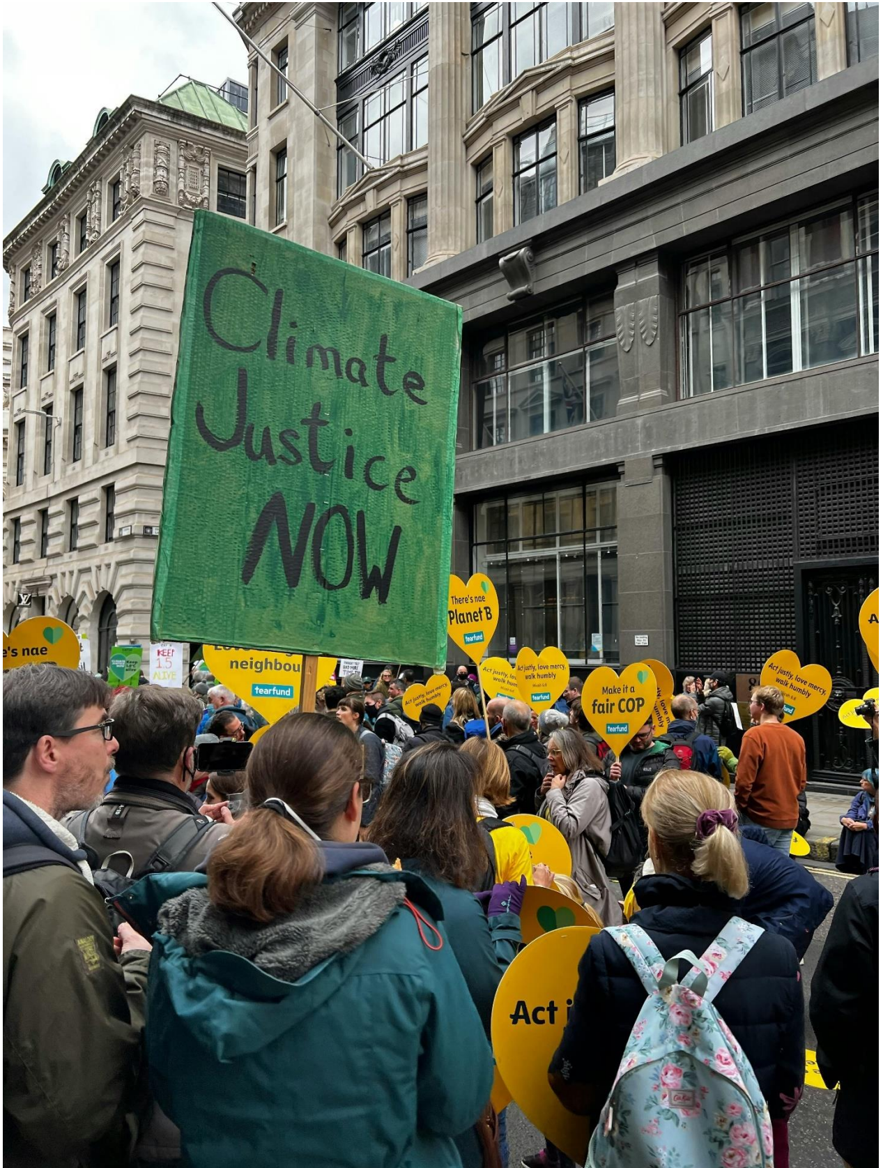
Figure 1: A typical view of environmental activism

Those engaged in environmental activism offer invaluable insights into both the physical and human elements of our world. By hearing from people who are (or were) addressing challenges from multiple angles - whether through scientific research, education, conservation efforts, or