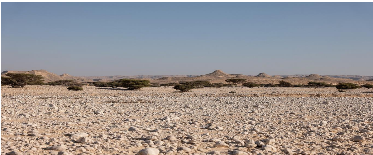
Image sources: Cyclone, NASA Earth Observatory, Flooding, Pok Rie Pexels, Drought © Ana-Maria Pavalache

a. Using evidence from the images, identify the environmental challenges Oman faces from climate change.