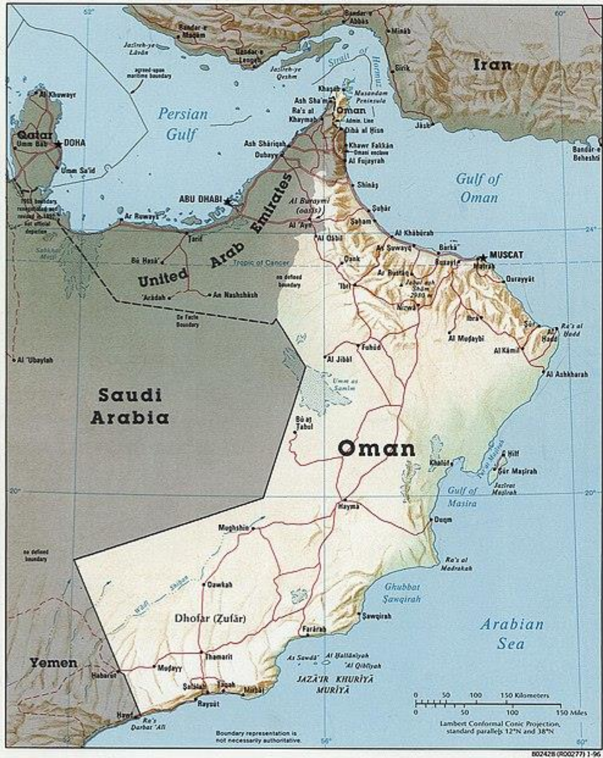
Oman 1996 CIA map. Wikimedia Commons, Public Domain