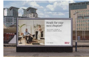
Examples of Knight Frank advertisements out and about in London.

The Research Analytics Team at Knight Frank use a variety of different tools in their work. One of the most important ones is GIS (Geographic Information Systems). GIS is a computer-based system used to capture, store, analyse, manage, and present spatial data. GIS is used by a wide variety of organisations. These include businesses like Uber Eats and Deliveroo to match users with nearby drivers and restaurants and ensure services are reliable; it is used by environmental agencies to map areas of land that are at risk of flooding or identify areas of habitat that are at risk; and it is used by police forces to map where crimes take place so that they can allocate resources appropriately, helping to protect the community.