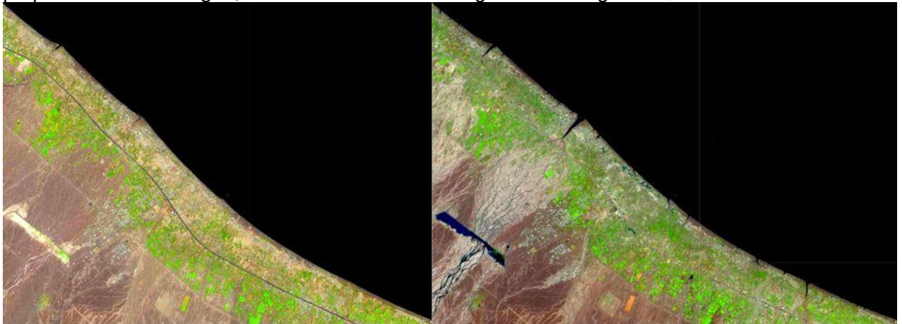
Satellite image showing before (left) and after (right) of the storm.

Storm surges have eroded some of the coastline and caused damage to homes and infrastructure as well as flood waters submerging roads leaving them impassable. It is estimated that over 1000 properties were damaged, the cost of the total damage is in the region of $520 million.